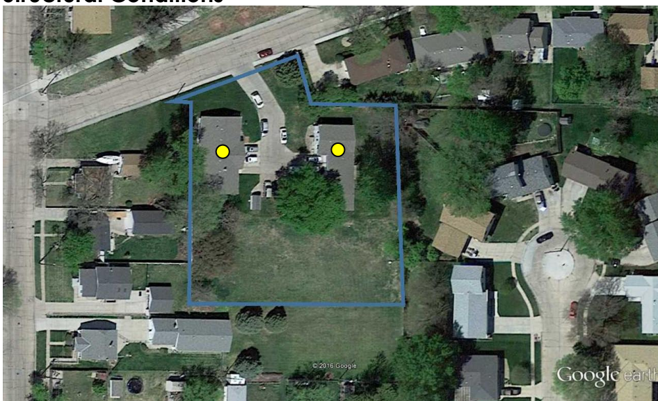
Figure 4 Structural Conditions