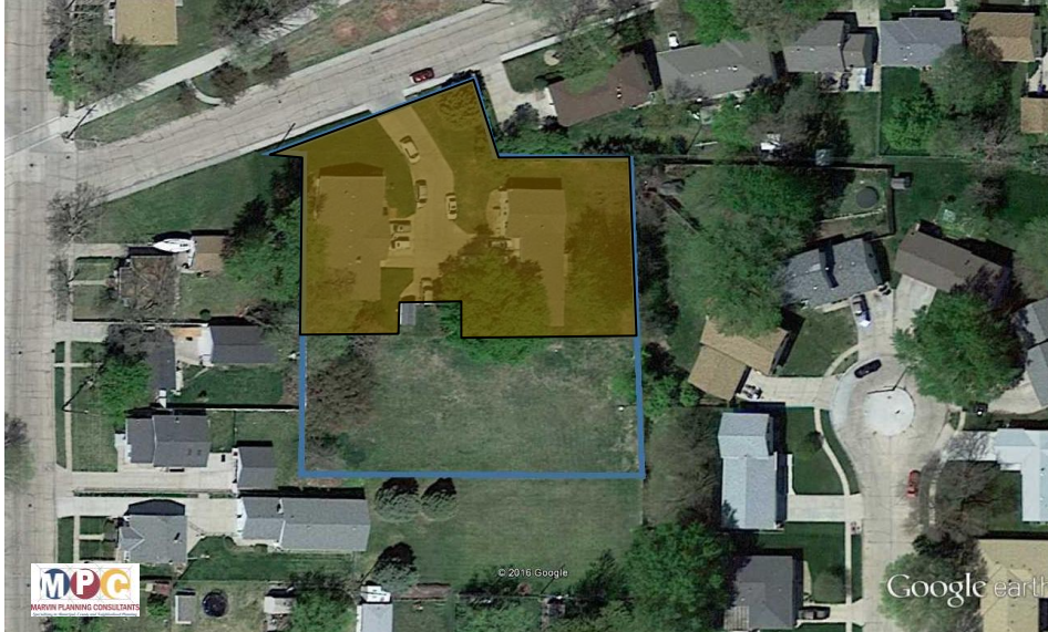
Figure 2 Existing Land Use Map