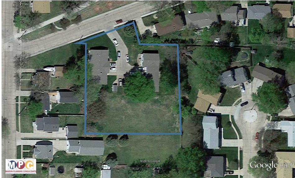
Figure 1 Study Area Map