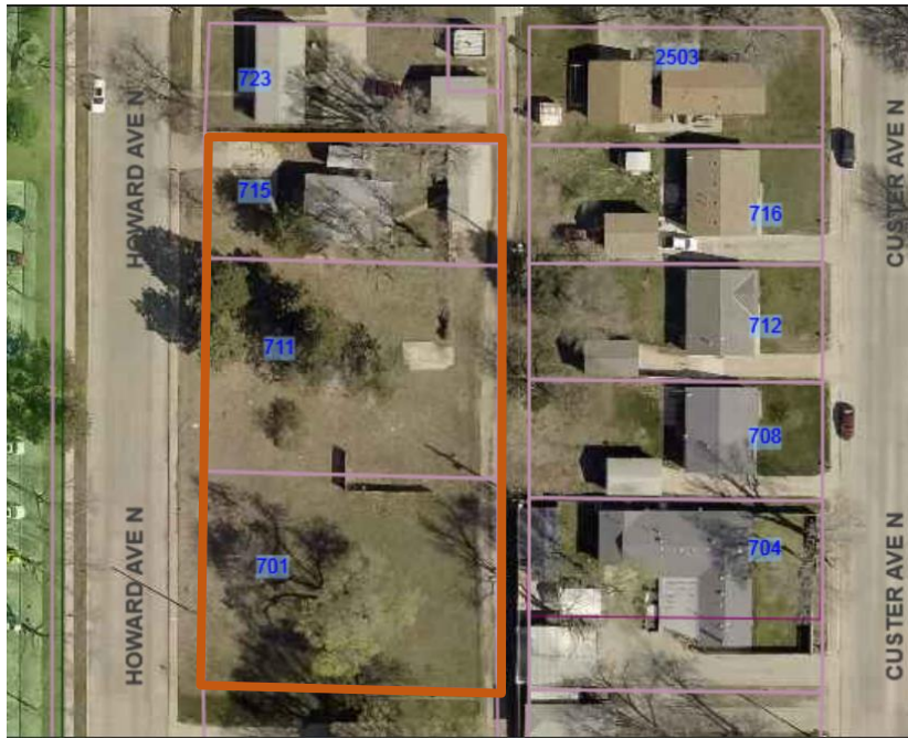
Figure 1: Study Area Map

Note: Lines and Aerial may not match.