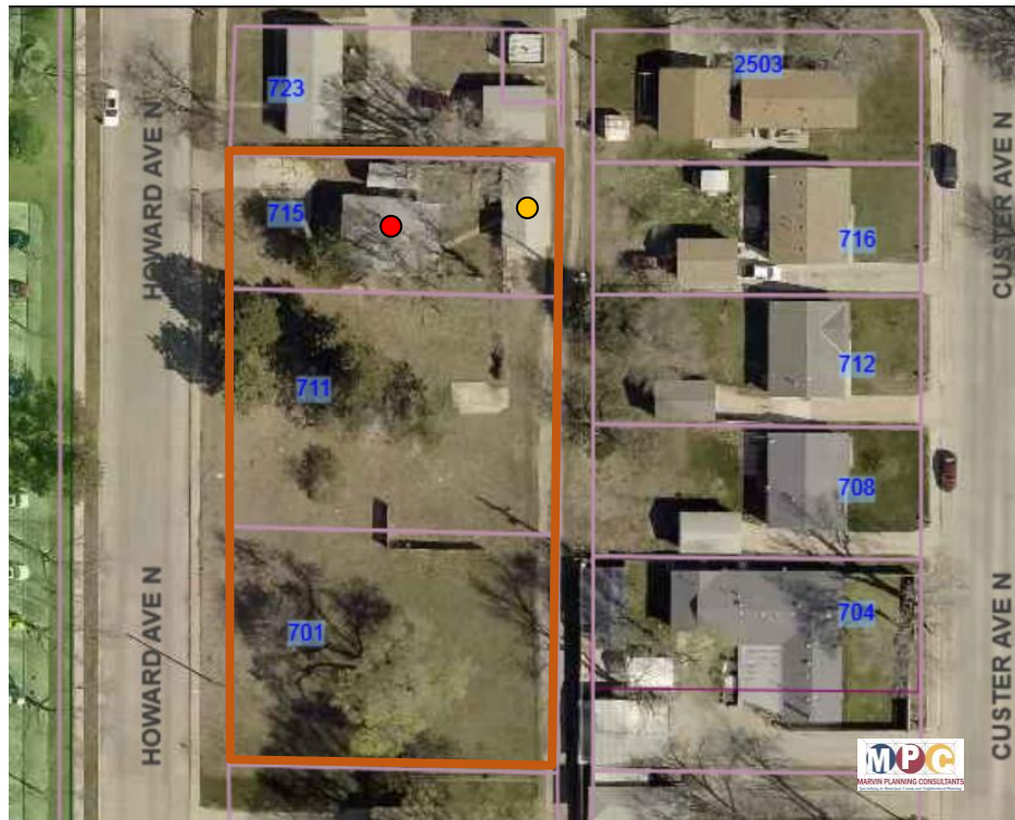
Figure 5: Unit Age Map