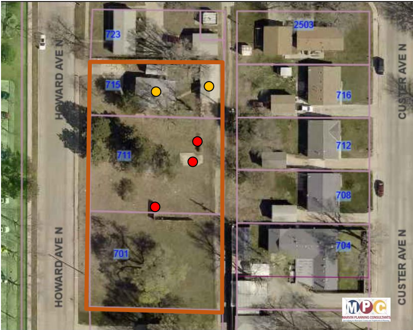
Figure 3: Structural Conditions

Note: Lines and Aerial may not match.