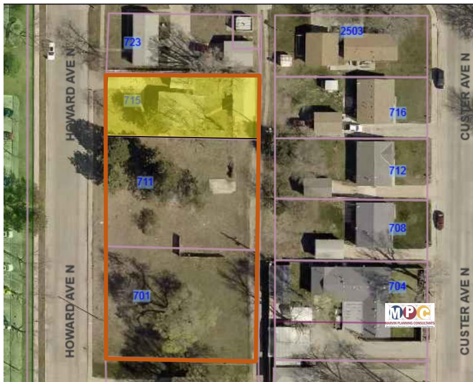
Figure 2 Existing Land Use Map

Note: Lines and Aerial may not match.