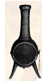
Chiminea Outdoor Fire- place