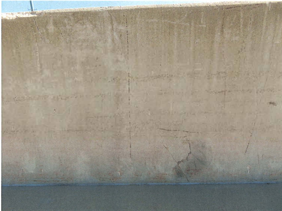
Photo 22 - Example of Diagonal Crack Along East Wall of Rooftop Level