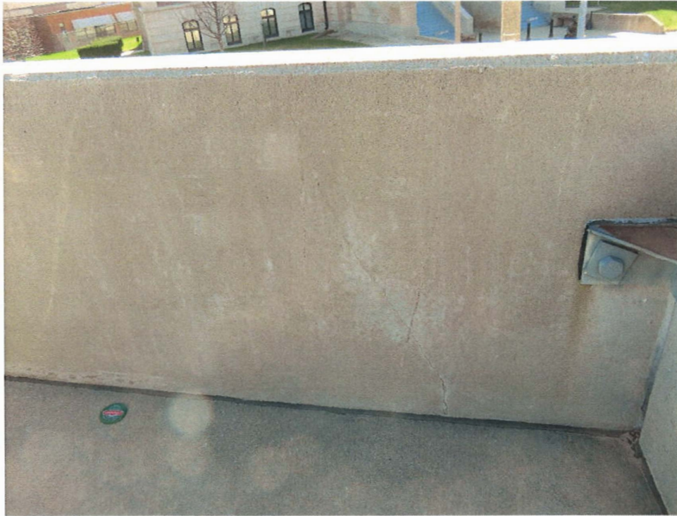
Photo 23 - Diagonal Crack Along South Wall of Rooftop Level