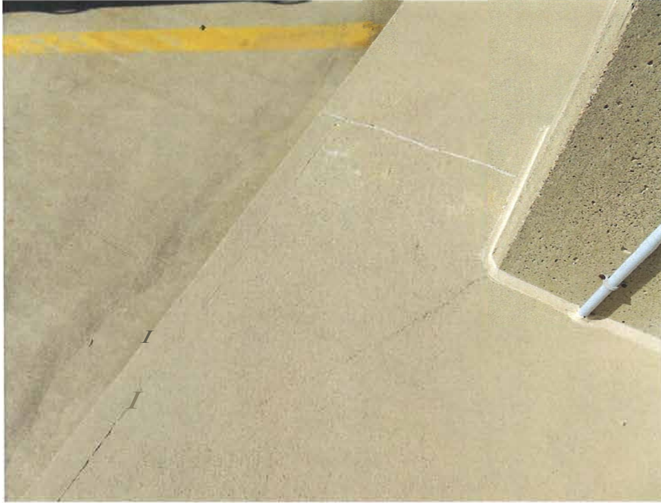
Photo 9 - Example of Hairline Cracks in Sidewalk on North Side of Rooftop Level