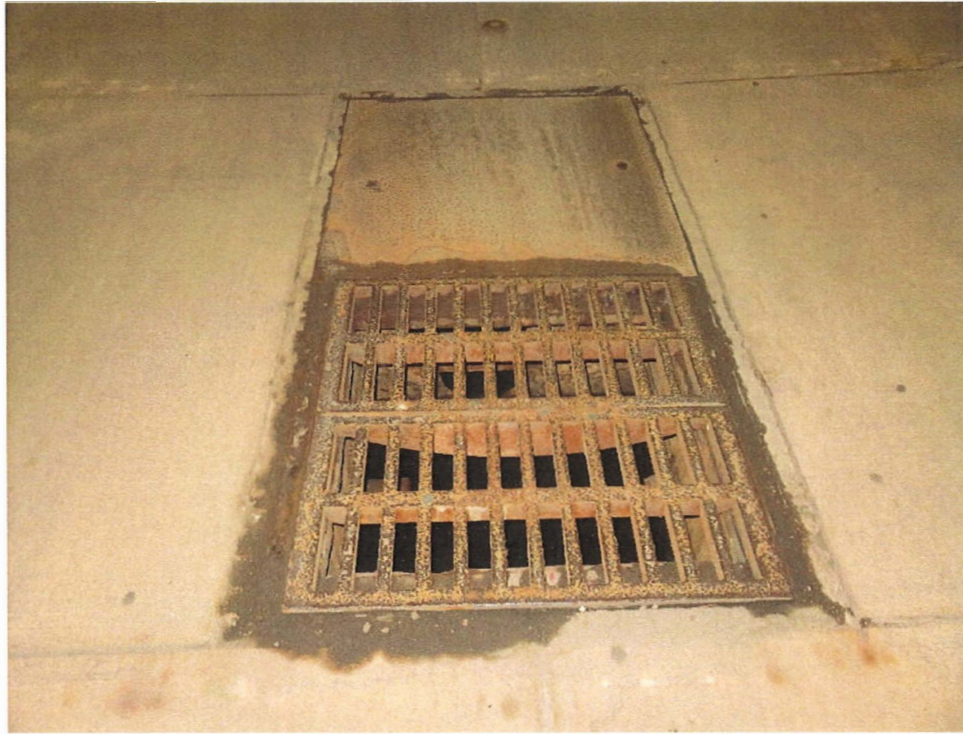
Photo 19 - Large Junction Box w/ Standing Water at Center of Lower Level