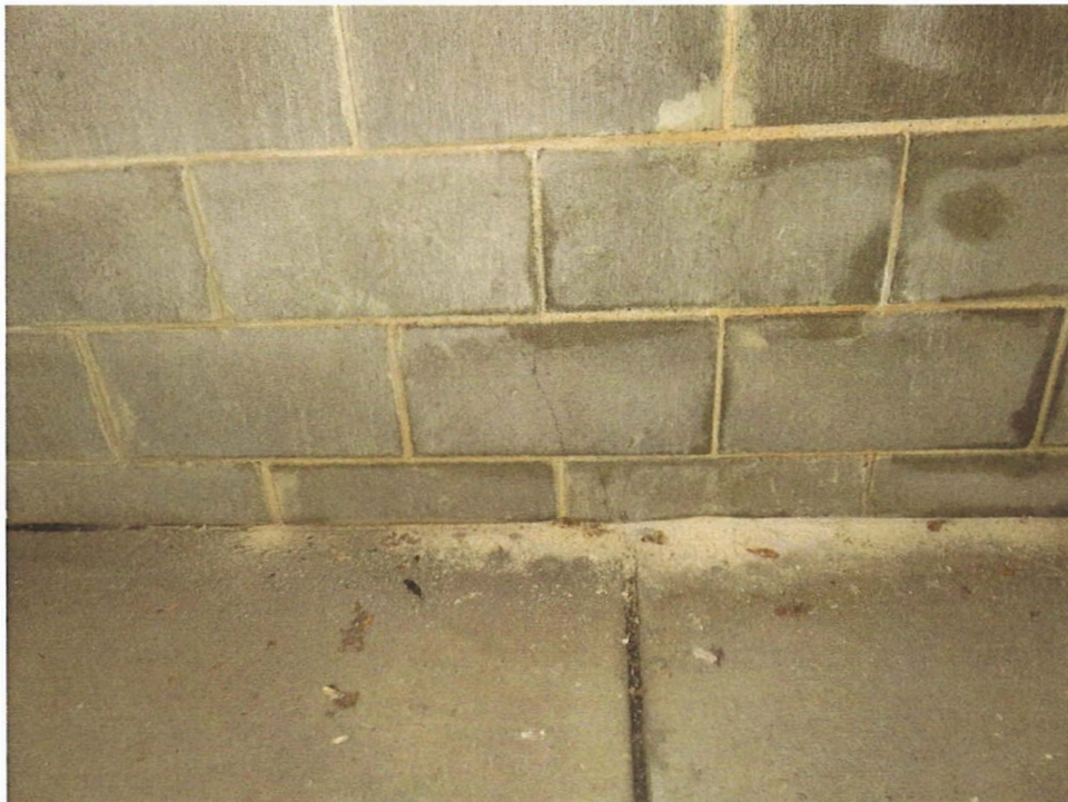
Photo 28 - Evidence of Moisture in CMU and Piles of Mortar Dust on East End of Garage