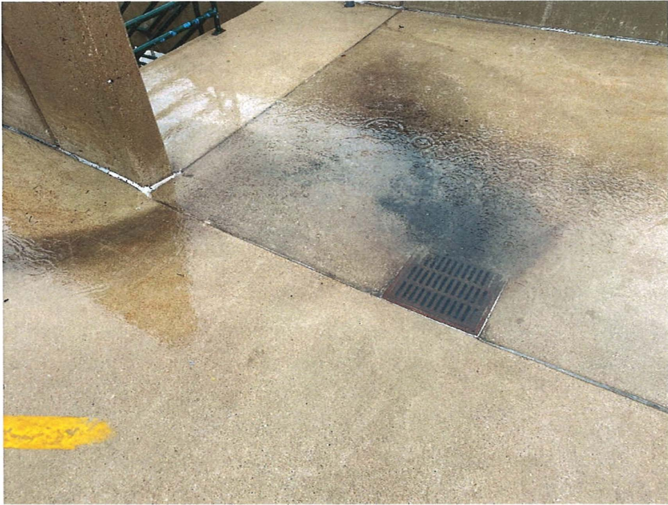
Photo 1 - Plugged Drain at Southwest Corner of Rooftop Level