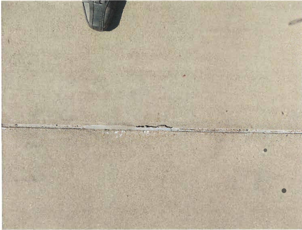
Photo 7 - Example of Poor Seal Joint on Rooftop Level