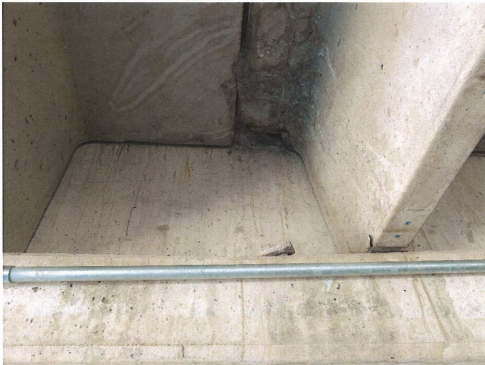
Photo 12 - Spalling of Concrete & Exposed Rebar in Concrete Tee Beam on North End of Main Level