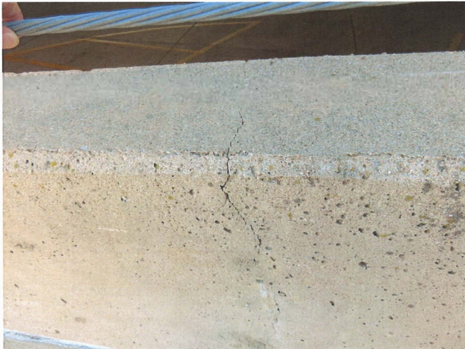
Photo 24 - Vertical Crack Along Interior South Wall of Northern Half of Rooftop Level