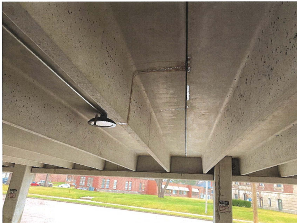
Photo 8 - Example of Rainfall Leak from Rooftop Level