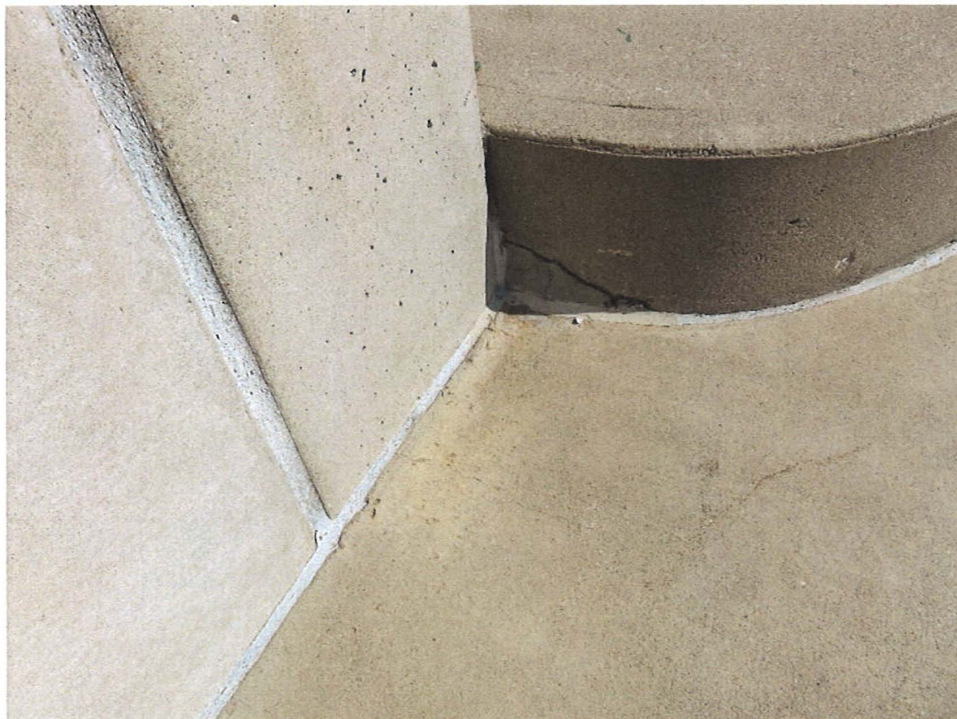
Photo 6 - Spalled Concrete Near Center Railing of Rooftop Level