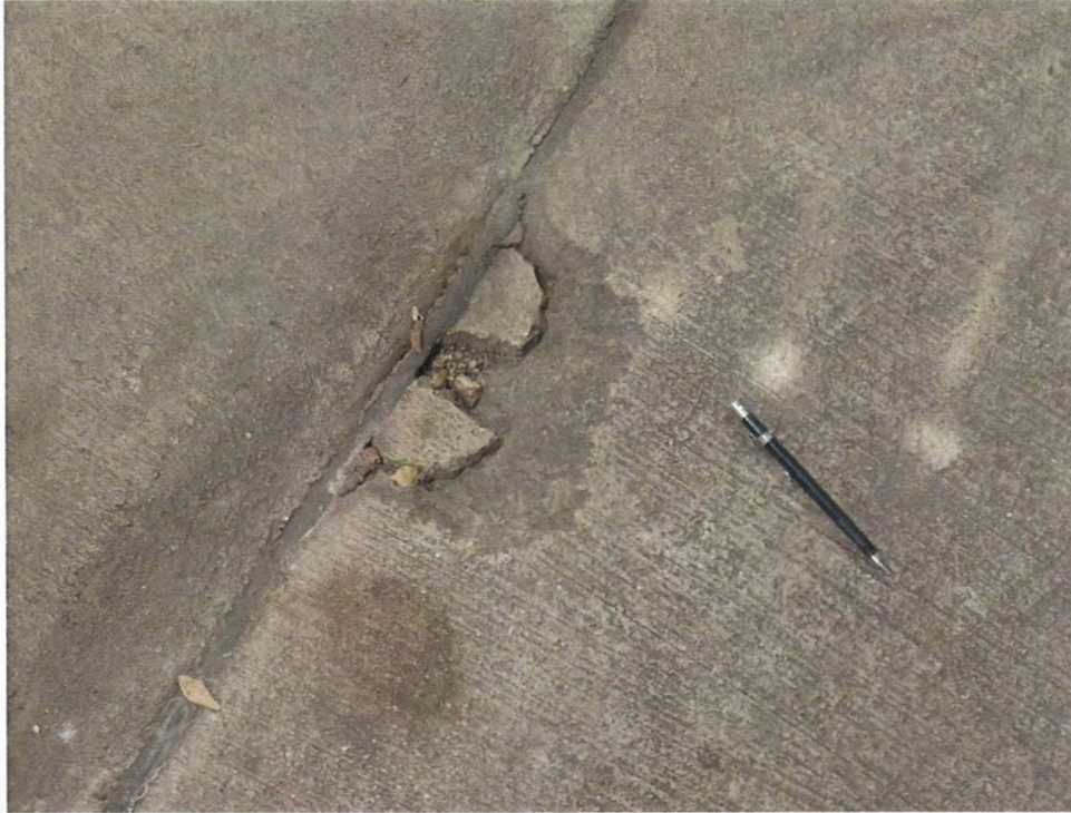
Photo 15 - Example of Spalled Concrete Along Joint Edge in Lower Level