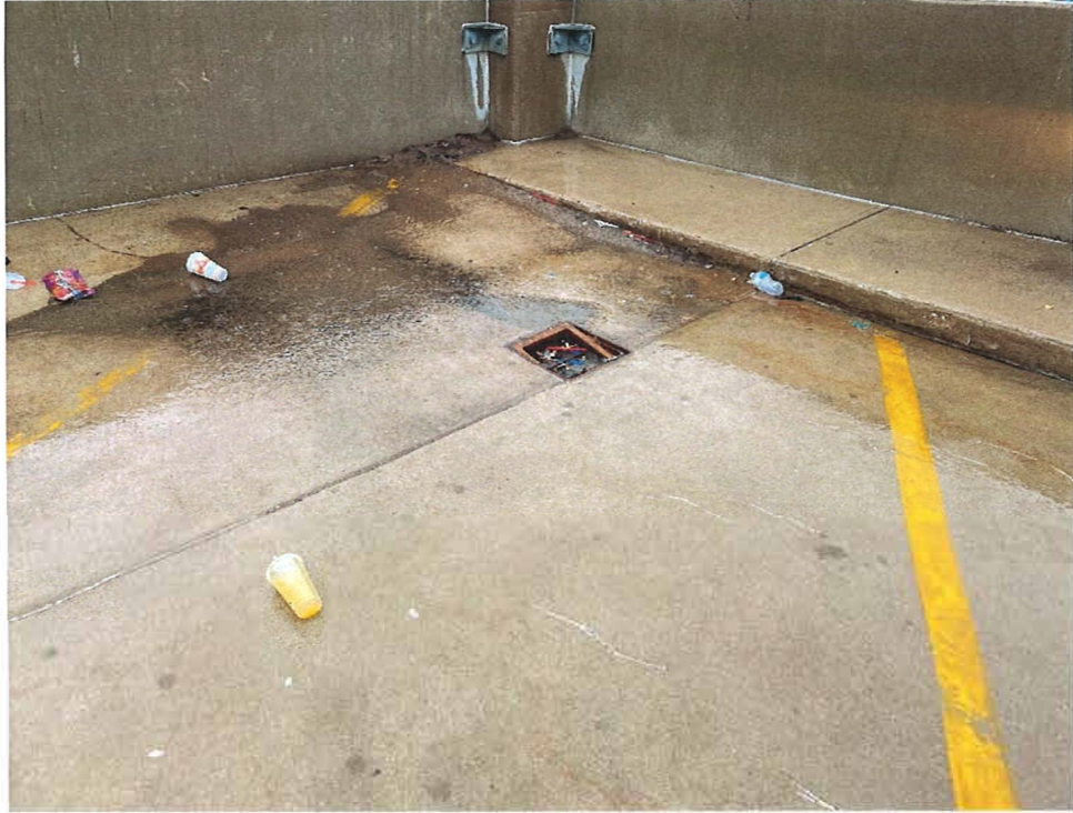
Photo 3 - Ponding and Debris Filled Drain at Southeast Corner of Rooftop Level