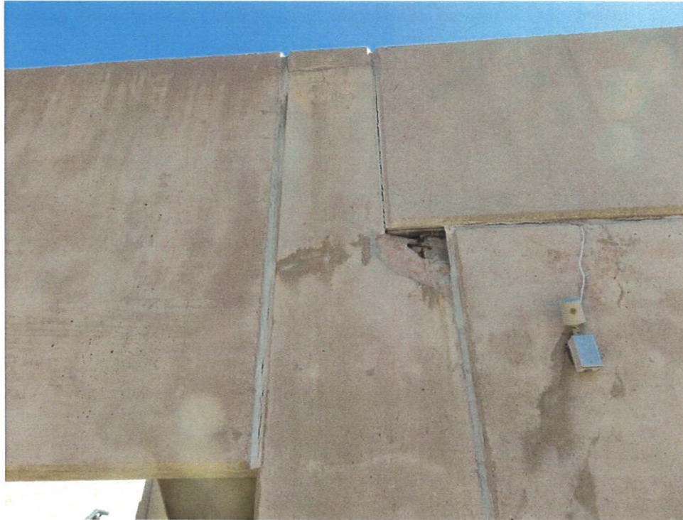
Photo 25 - Spalled Corner of Exterior Precast Column on West Face of Garage