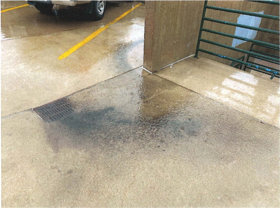
Photo 2 - Rainwater Flowing to Stairwell Due to Plugged Drain