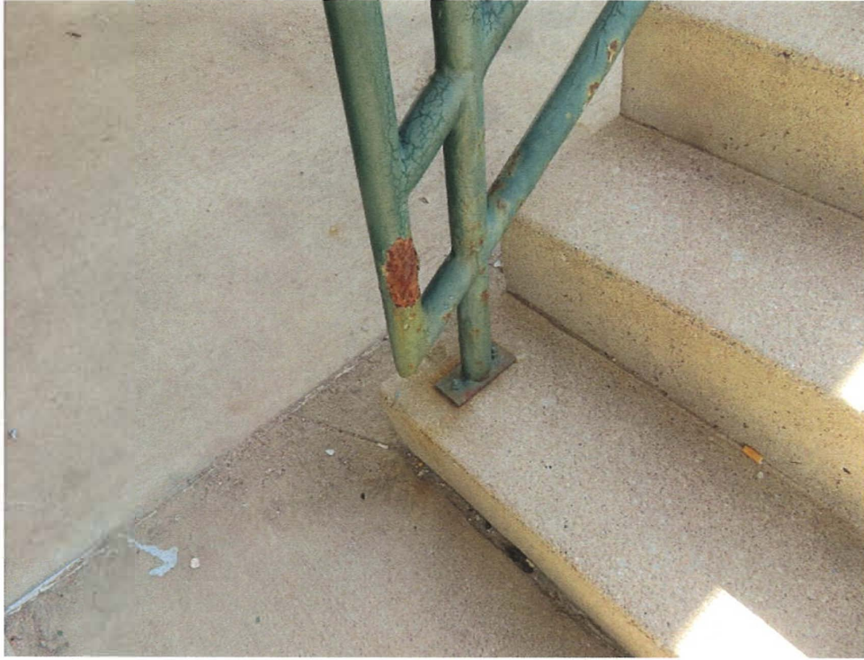
Photo 21 - Example of Rusted Surface of Railing in Northwest Corner of Garage