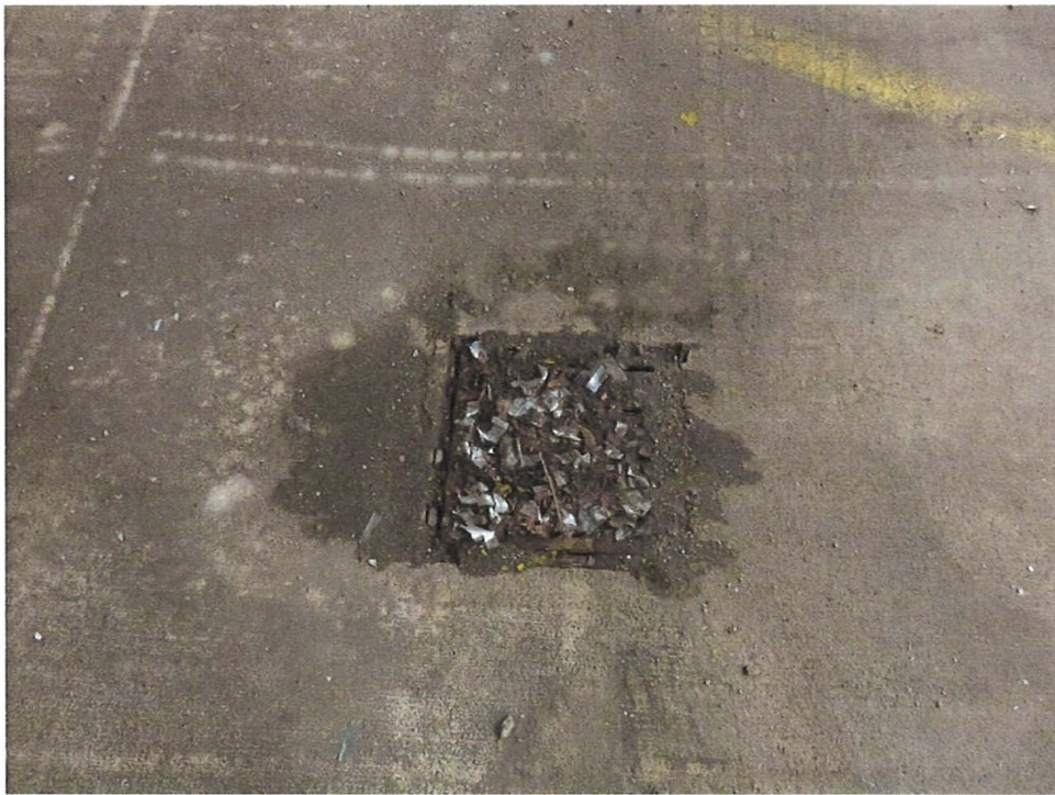
Photo 18 - Typical Floor Drain Clogged with Dirt & Debris Near Center of Lower Level