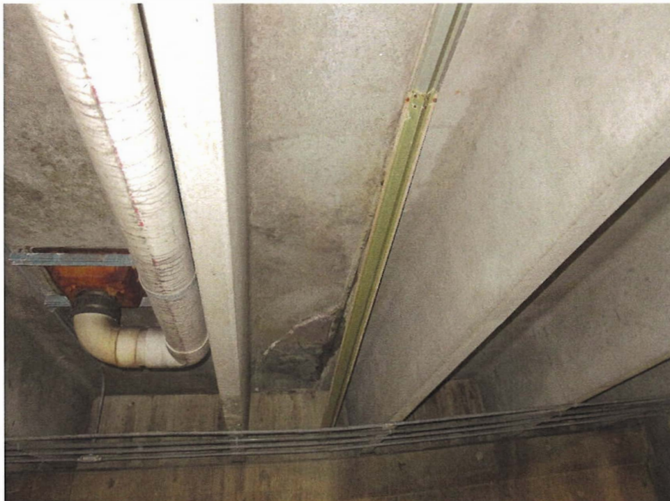
Photo 20 - Partially Fallen Rain Track of Lower Level