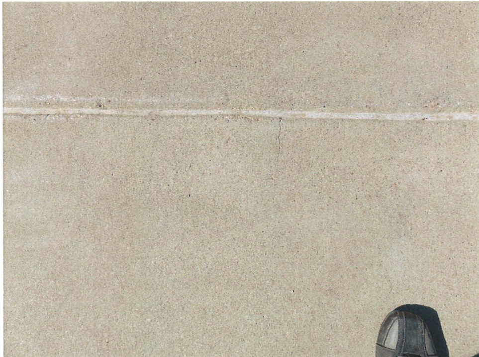
Photo 4 - Typical Hairline Cracks in Topping of Rooftop Level