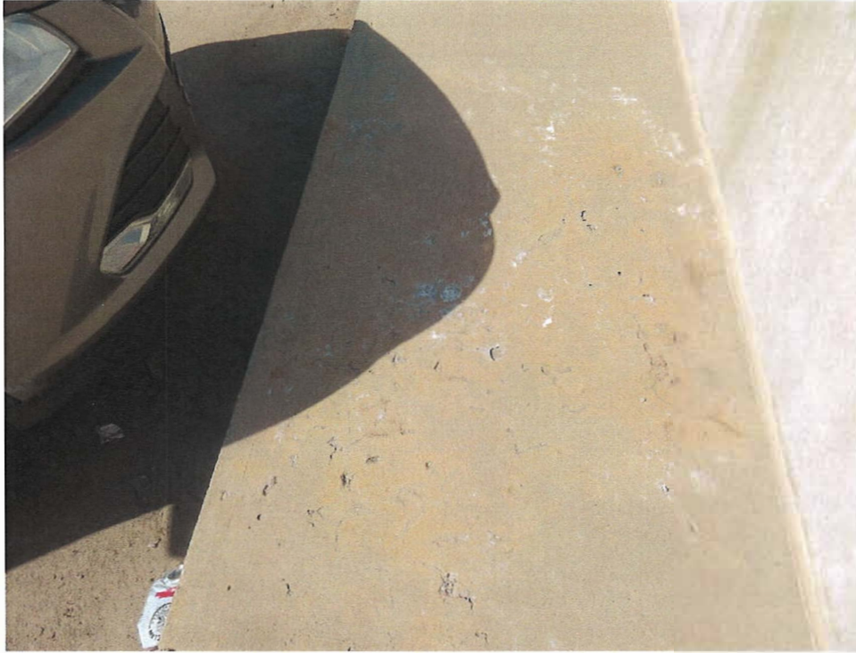
Photo 11 - Surface Deterioration of Sidewalk on North Side of Rooftop Level