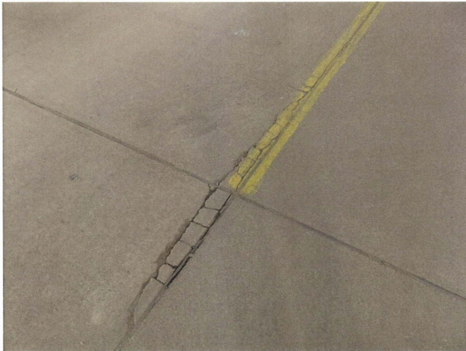
Photo 16 - Example of Spalled Concrete Along Joint Edge in Lower Level