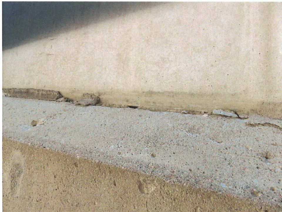
Photo 14 - Deteriorating Grout/Caulk in Horizontal Joint of North Wall of Main Level