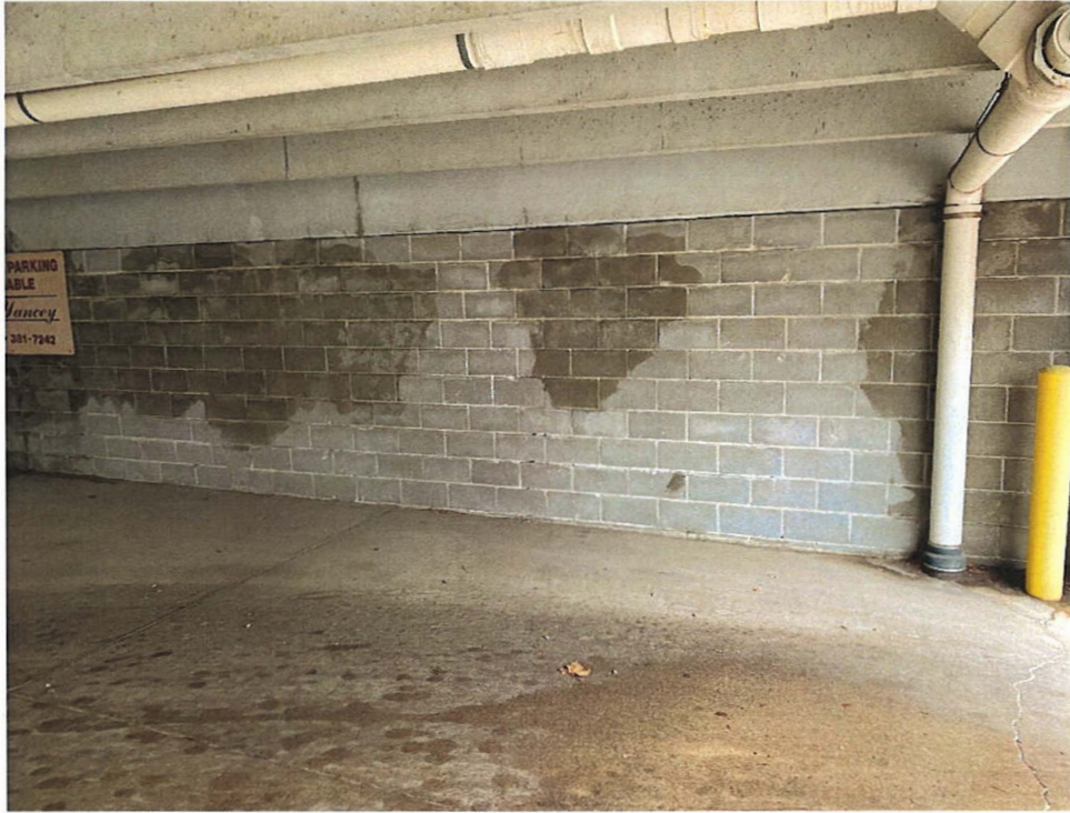
Photo 27 - Evidence of Moisture in CMU During Rainfall Event on East End of Garage