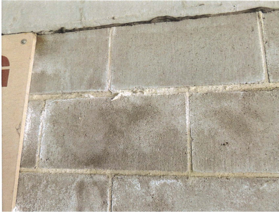
Photo 29 - Evidence of Soft Mortar Joints in CMU on East End of Garage