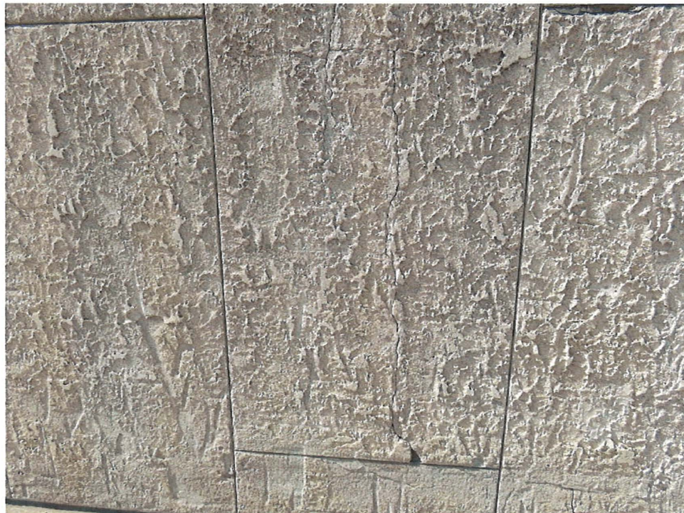
Photo 26 - Example of Significant Cracking in Stucco Finish on East End of Garage