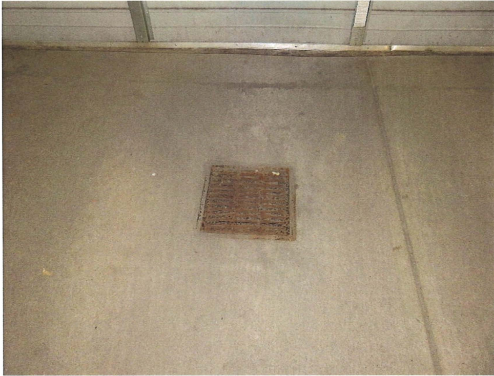
Photo 17 - Floor Drain Clogged with Dirt & Debris Near Overhead Door on East End of Lower Level