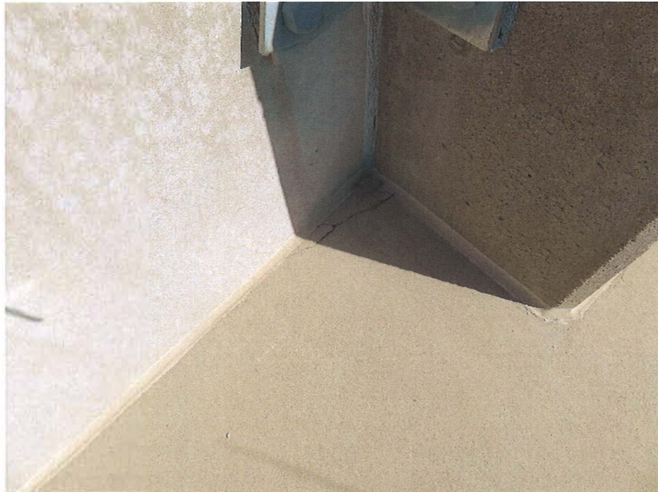
Photo 10 - Example of Spalled Sidewalk on North Side of Rooftop Level