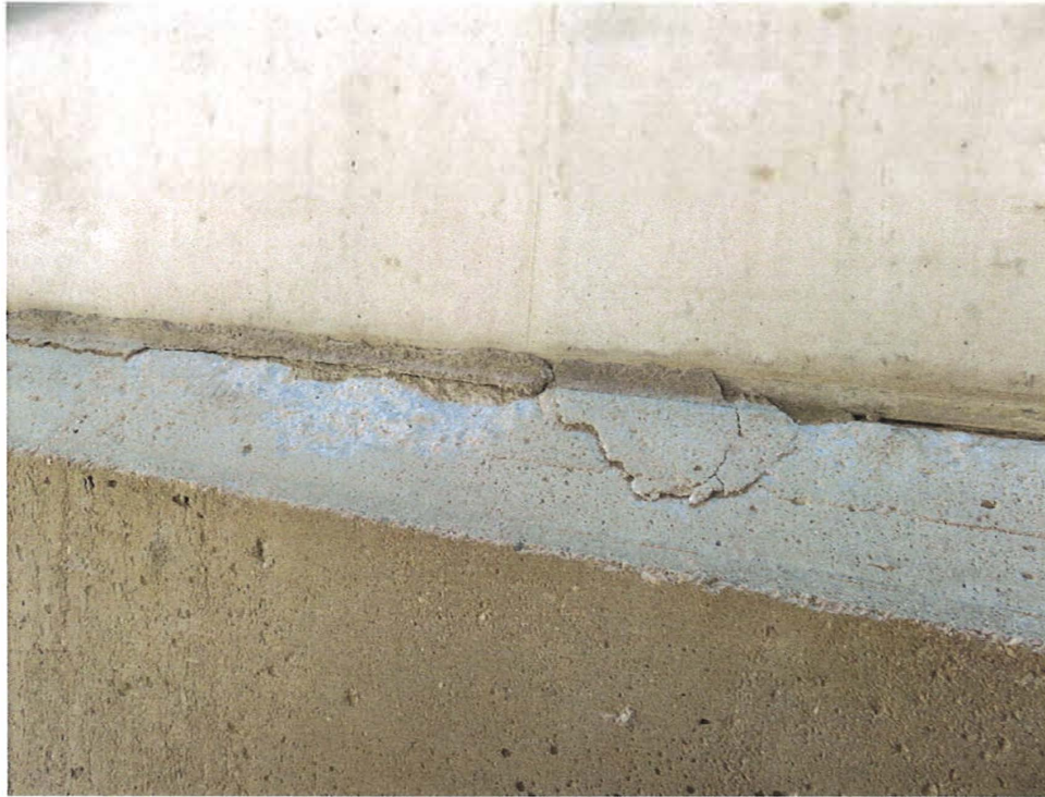
Photo 13 - Spalled Concrete in Horizontal Joint of North Wall of Main Level