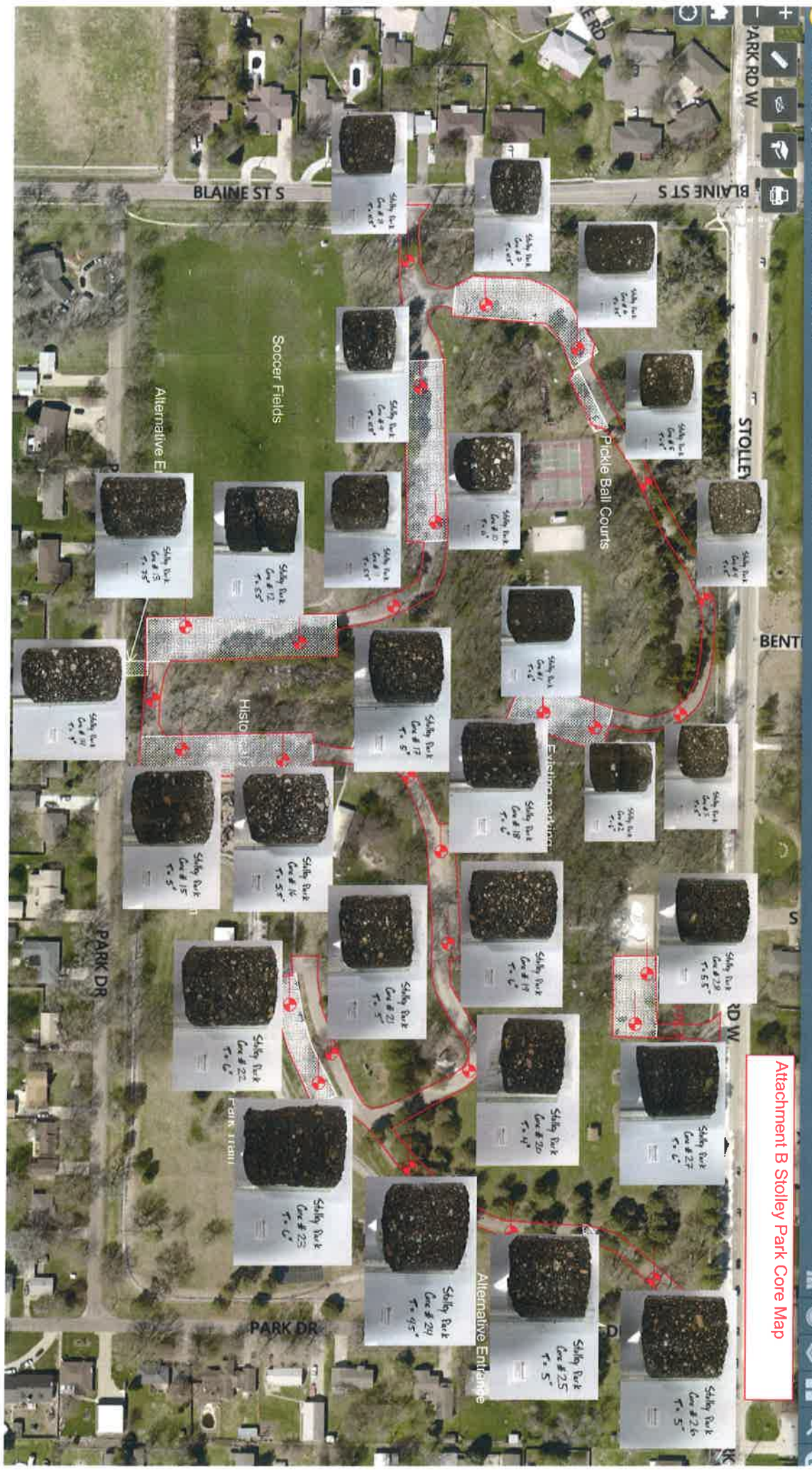
Attachment B Stolley Park Core Map