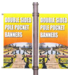
Two (2) 30" x 60" banners attached to each pole

Request additional poles identified above be allowed to be utilized hanging double sided pole banners as shown below.