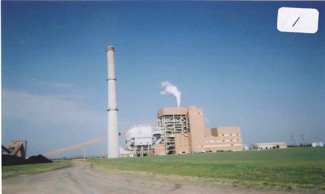
Photograph 1 – NOTE: Overall view of the 412 ft. brick lined reinforced concrete stack located at Platte Generating Station in Grand Island, NE.