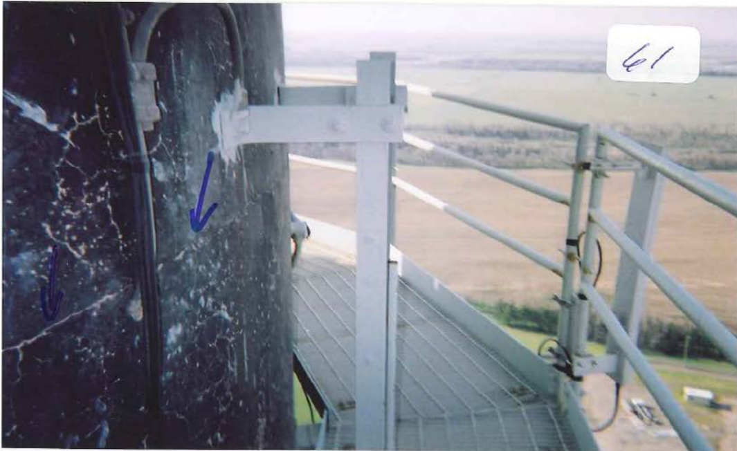
Photograph 61 thru 62 – Top platform NOTE: The top platform exhibits minor rust development. However, was found to be in good condition. The concrete column depicts a horizontal crack in the cold pour joint.