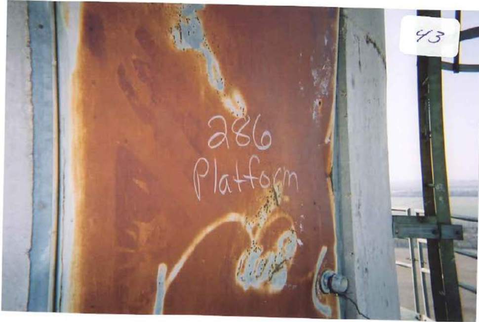
Photograph 43 thru 44 – 2 nd platform NOTE: Rusted and deteriorated access door.