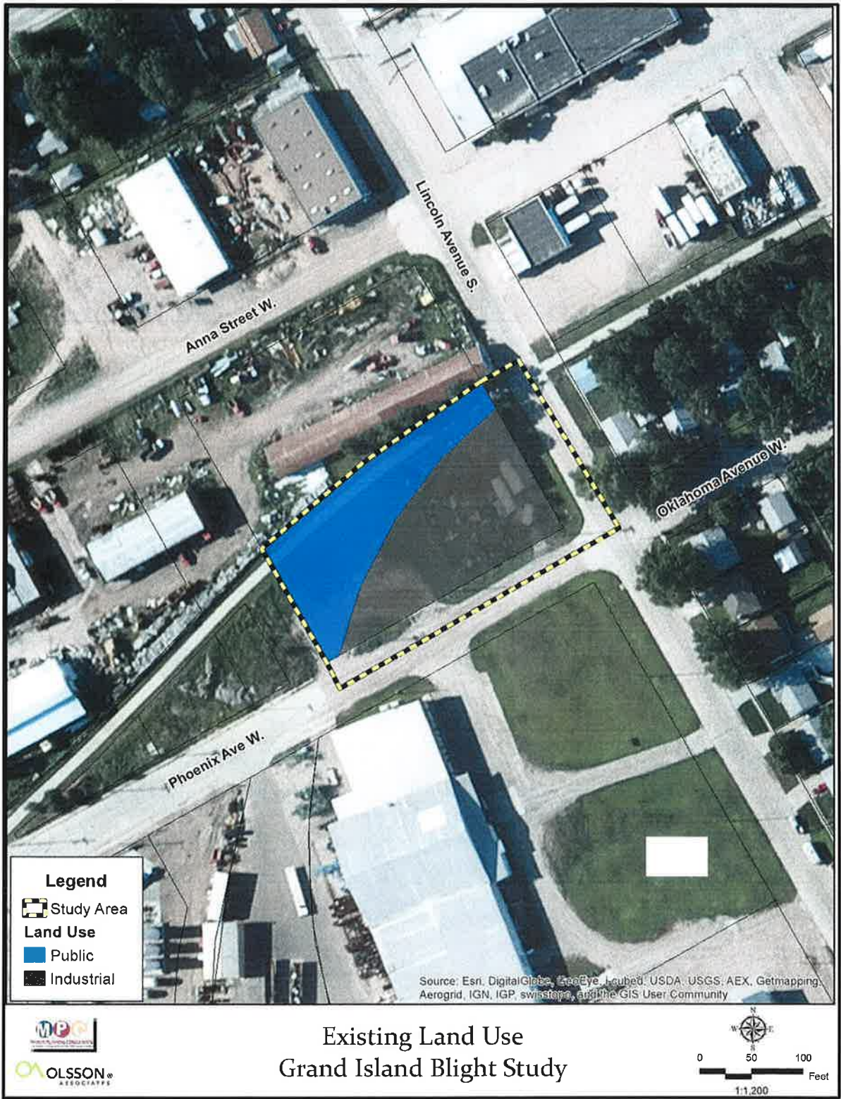
Figure 2 Existing Land Use Map