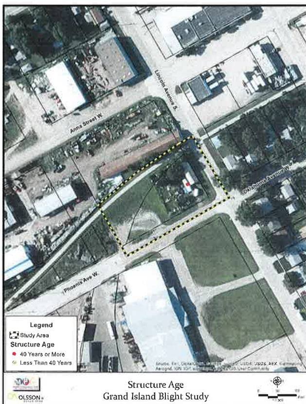
Figure 3 Unit Age Map