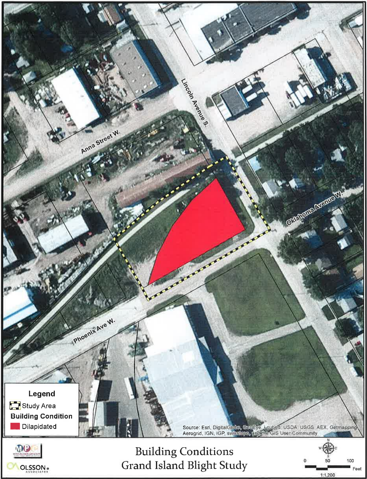
Figure 4 Structural Conditions