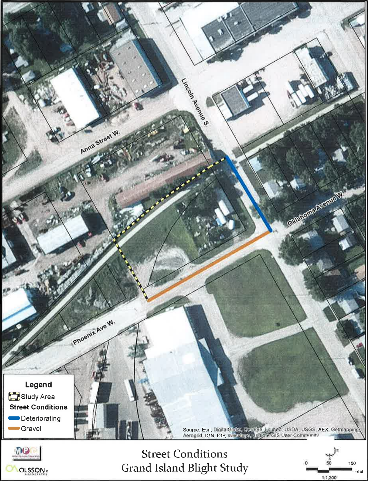
Figure 6 Street Conditions