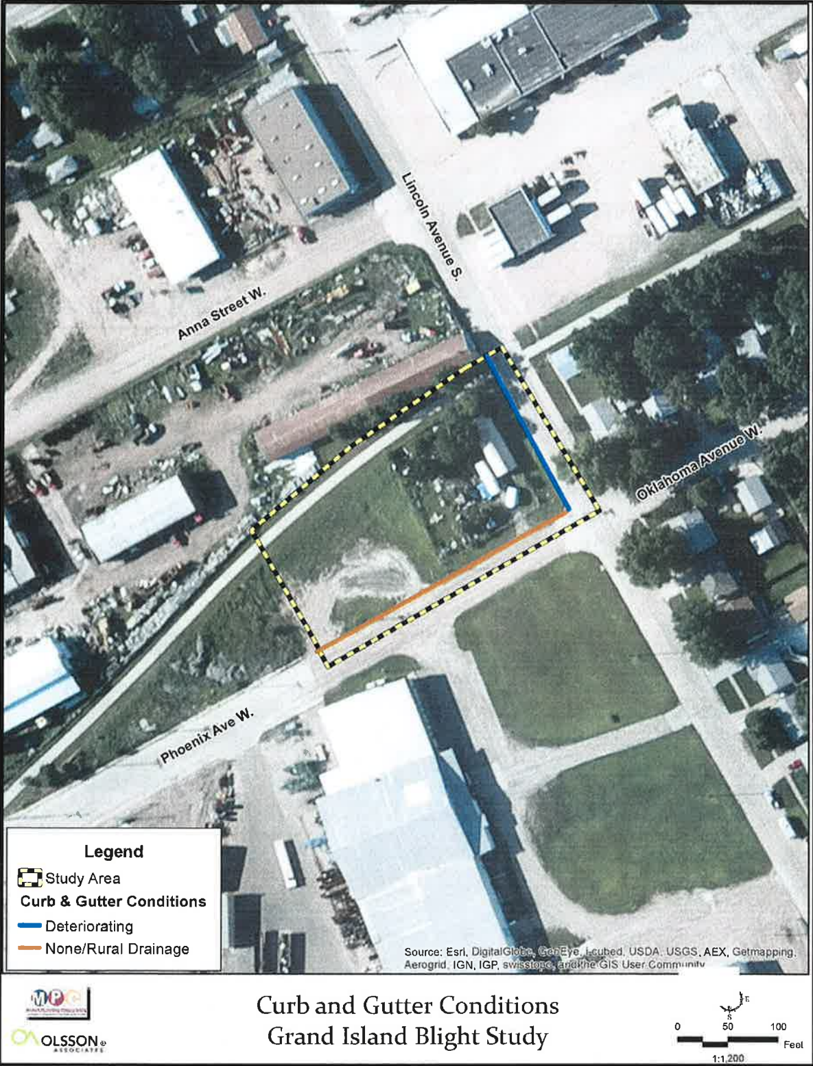
Figure 7 Curb and Gutter Conditions

Source: Marvin Planning Consultants and Olsson Associates, 2014